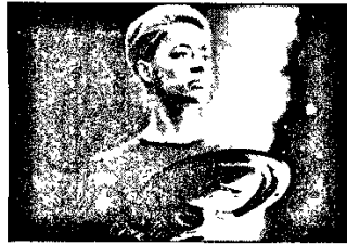
FLYING INTO THE FUTURE

Tractor beams in 'Star Trek' have long used a subspace or graviton interference pattern created by two beams to pull in their targets although, being sci-fi, the precise technology has never been clear. The real-life breakthrough came after scien-